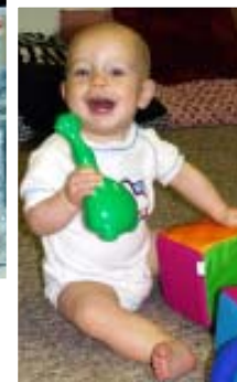
A ringing toy phone, a tin washtub drum, and a traditional baby rattle delight these active little ones.