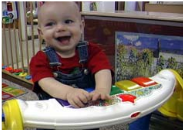
A gleeful smile signals the happy realization that baby's own pushes bring this musical toy to life.

The very best types of games and early learning opportunities include ones in which a young child's behavior causes an object to respond in an interesting, engaging way.