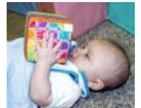
Baby shakes this noise-making block again and again.

WAIT, and repeat the "game" as often as the child repeats the focus action.