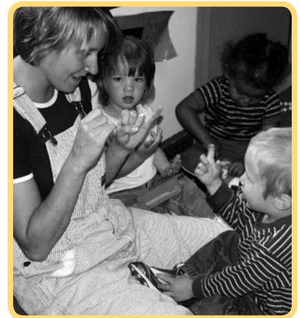
Lap games charm young children with light-hearted, immediate rewards.

Stop 'n' Go Vocal Play. For some spontaneous fun, begin singing a favorite song to your child. Pause suddenly, then guide your child's hand to pat your arm, touch your nose, or make some other gesture as a sign for you to begin singing again. Repeat until he realizes that his action is what makes you continue singing time after time.